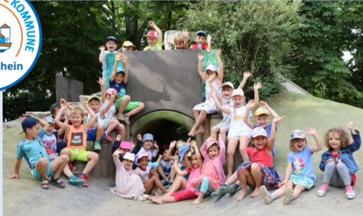
Wolfgang Dietz Lord Mayor, City of Weil am Rhein